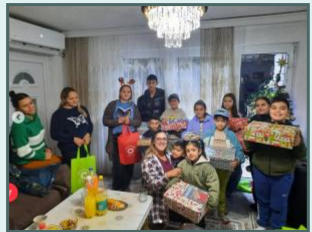
Distribution of Christmas Boxes in Cento