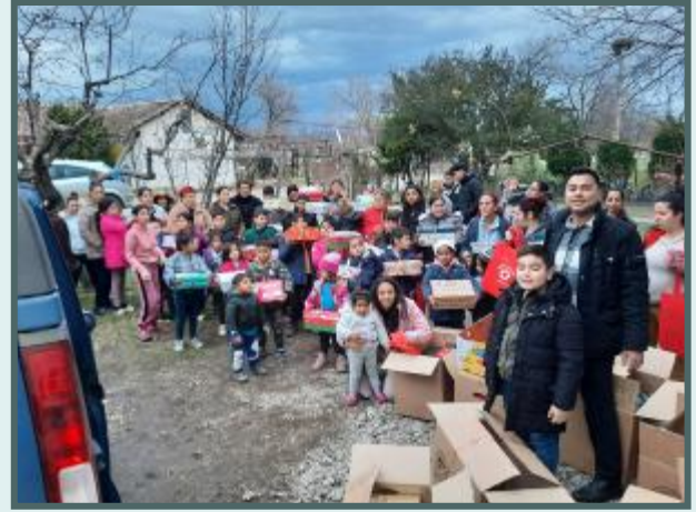
Distribution of Christmas Boxes in Ergelija