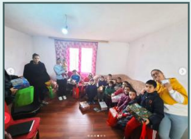
Distribution of Christmas Boxes in Karbinci