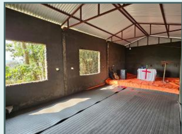
Cana Church, in rural South-East Nepal near the Indian border.