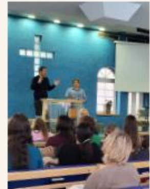
A photo of a Sunday service we've had together with the local Christian drug rehabilitation center.

In a way, we feel like we are experiencing harvest time. It's exciting to see new people finding a place among us, building relationships, and becoming part of our church family. We've been praying for this for long time, and we're glad to see it happening. It's all God's grace, and now we pray that in His grace, He will teach us to take care of these people and help them grow in their faith and dedication to our Savior.