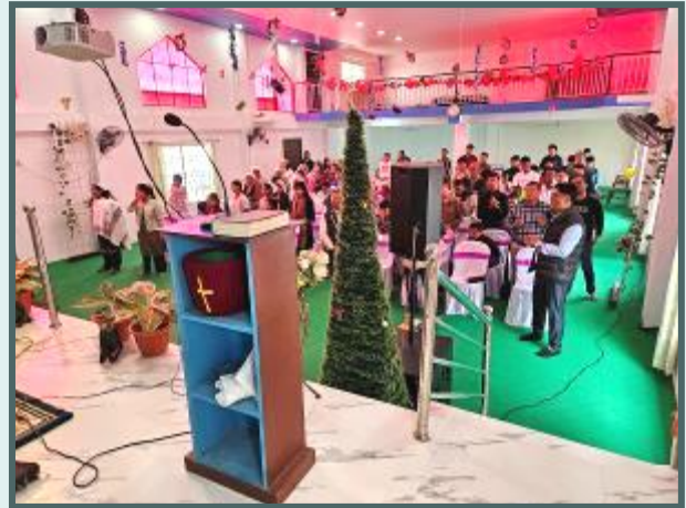
Above: Bethel EC Church — Below: Grace EC Church