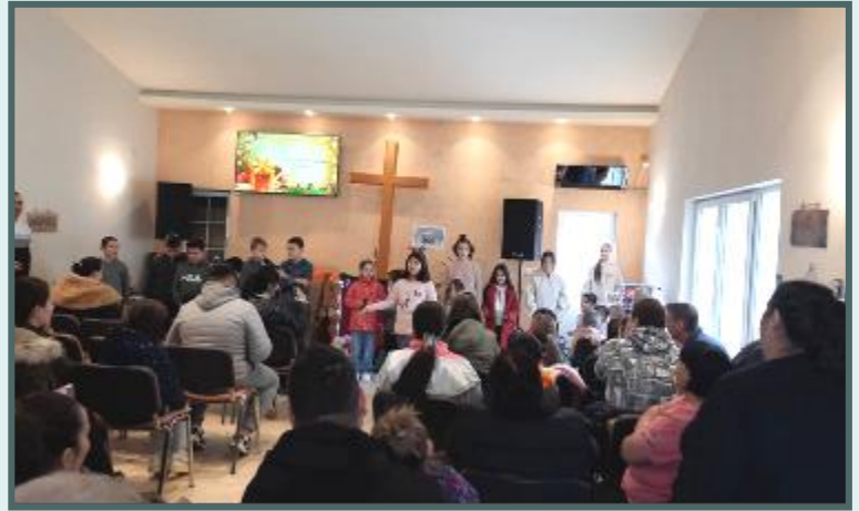
Above: Christmas Celebration in Drachevo