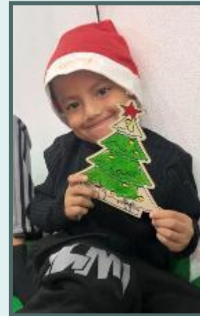
Children's Christmas Celebration at Bethel Evangelical Congregational Church, Dharan