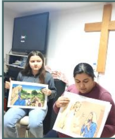
Below: Christmas Celebration in Kozyak